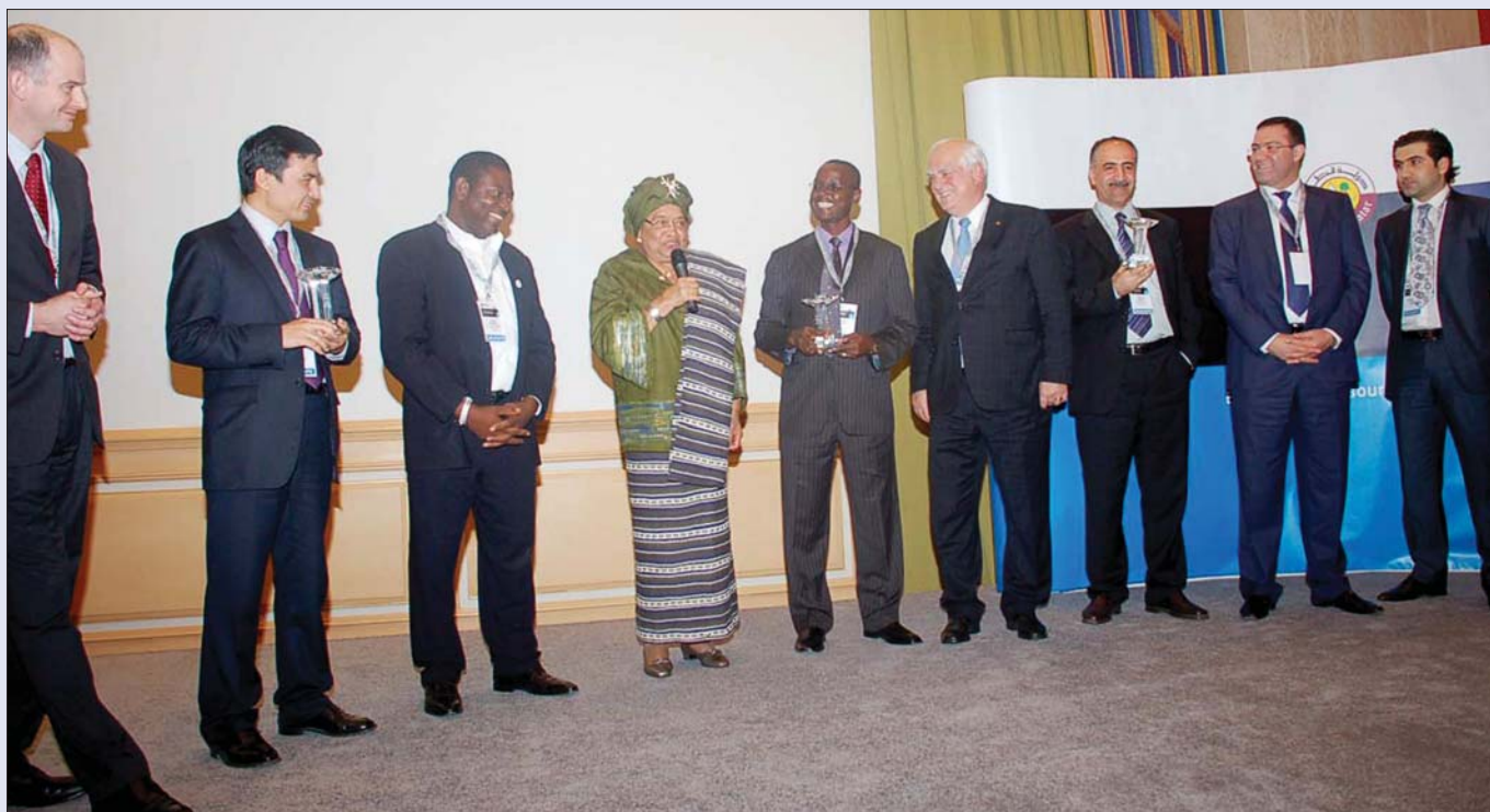
President Sirleaf making remarks after receiving Liberia EITI award, Doha, Qatar

Liberia has become the first EITI implementing country in the world to win the Extractive Industries Transparency Initiative (EITI) Implementing Country Award. The Award recognizes countries that have demonstrated the best overall performance in terms of EITI implementation during a given year.