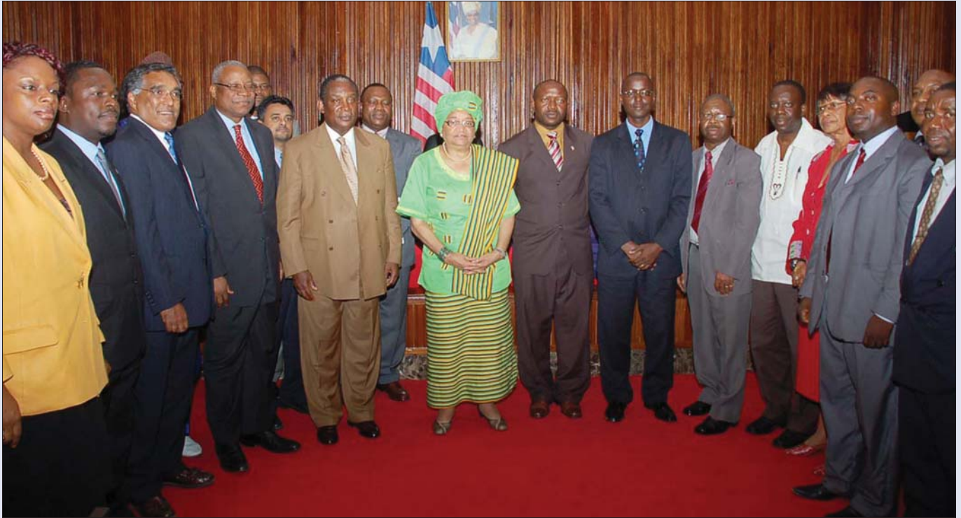
President Sirleaf and LEITI Steering Group at the launch of Liberia's 1st EITI Report

The President of Liberia, H.E Ellen Johnson-Sirleaf has launched Liberia's first Reconciliation Report of payments and revenues connected with the forestry, mining and oil sectors of Liberia. The Report was launched at a colorful ceremony held on 10 February 2009 at the Cecil Dennis Auditorium of the Ministry of Foreign Affairs in Monrovia, Liberia.