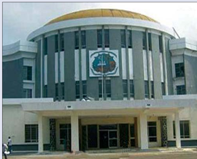
The House of Legislature

benefits of all Liberians and on the basis of equity and sustainability.” The full text of the Act can be found at www.leiti.org.lr .