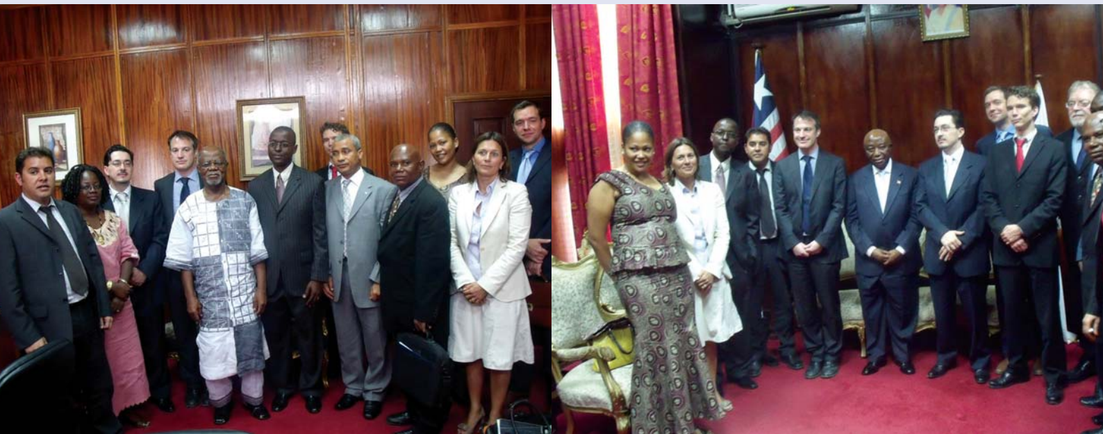
Joint EITI mission and LEITI validators with the leadership of the Liberian Senate (left) and the Vice President of Liberia, Dr. Joseph Boakai (right)

During the Mission's visit, they held separate meetings with the Vice President of Liberia, Dr. Joseph Boakai; the leadership of the Liberian Senate; and other Government officials as well as representatives of Companies and civil society. The Mission also attended the 23rd meeting of the LEITI Steering Group held on Thursday, April 23, 2009.