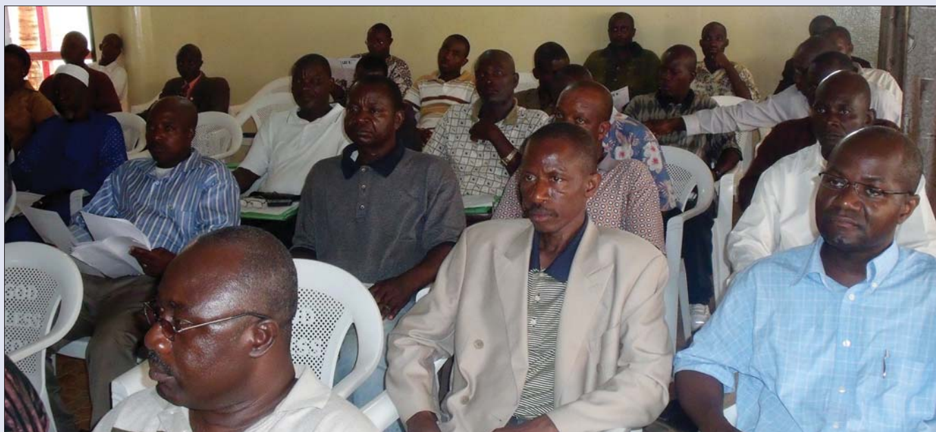
Stakeholders at the 2nd EITI Retreat

As part of continuing efforts to build the capacity of LEITI stakeholders and in order to critically review the findings, conclusions and recommendations of the first LEITI Report, the LEITI held its second Stakeholders Retreat on March 20 and 21, 2009. The Retreat was attended by over sixty LEITI Stakeholders representing logging, mining and oil companies as well as the Government of Liberia, Civil society and Liberia Development partners.