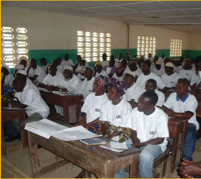
Grand Cape Mount