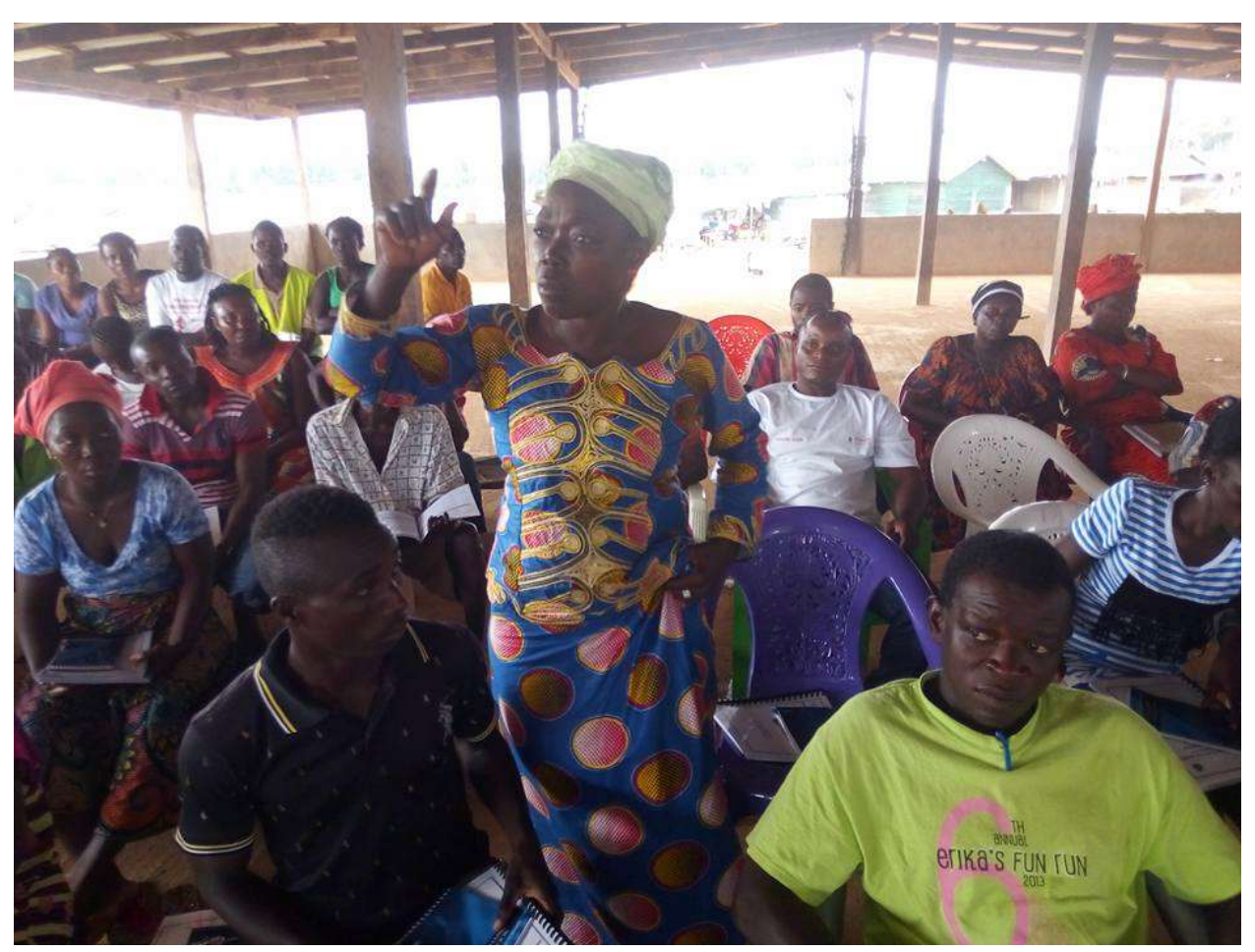
The matrix dissemination along with payment data on social development funds received by Government from companies. Kinjor, Grand Cape Mount County, the main concerns here were all centered on relocation.

The exercise came to a close in September 2017 paving the way for the dialogue. But while preparations were underway in March 2018, a new leadership at the Secretariat derailed the entire effort and the dialogue was not held.