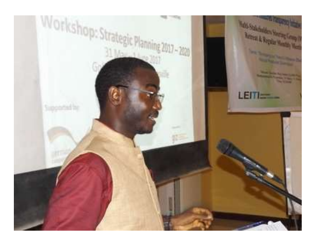
Former Finance Minister Boima Kamara speaking at the opening of the MSG Retreat in Monrovia