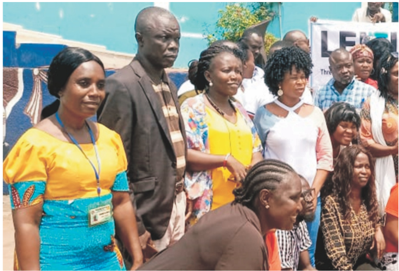
A segment of participants pose for the press at the close of the three day event in Buchanan

he Liberia Extractive Industries Transparency Initiative (LEITI) has ended the training of vetted County-based Civil Society Organizations in Liberia with a call for National Government to set aside forty percent of extractive revenue for feeder roads development. CSOs from Sinoe, Grand Kru, Maryland, RiverGee, Grand Gedeh and Nimba Counties made the call recently in Zwedru, Grand Gedeh County at the closed of a three day event for southeastern Liberia. The call was contained in a joint resolution signed by the CSOs attending and participating in the training exercises.